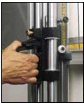
Fletcher's Patented "Break-Out" device completes the score in acrylics and glass with ease.