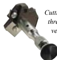
Cutting Turret equipped with three different blades for versatile cutting/scoring.